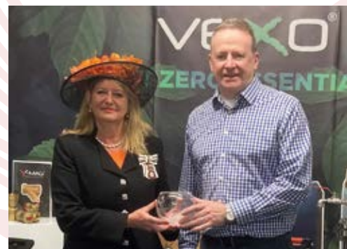
Presentation of King's Award to Vexo International of Biggleswade